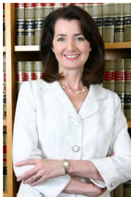
Hon. Elizabeth Crowder Judge, Dallas County Criminal Court No. 7