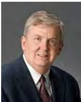
Hon. Doug Skemp Judge, Dallas County Criminal Court No. 3