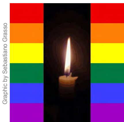
Graphic by Sebastiano Grasso

[The full text of Pres. Obama's address be found at: www.whitehouse.gov/blog/2016/06/12/president-obama-tragic-shooting-orlando ]