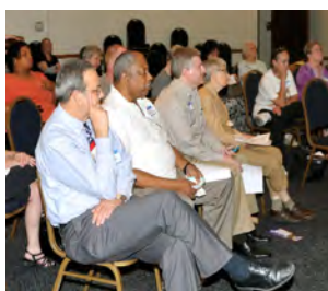
Always present at the Garland Area Democratic Club