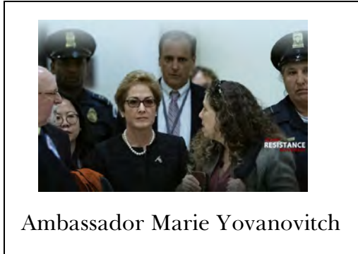
Ambassador Marie Yovanovitch

NOTE: This is taken from Facebook 101319 Trump Resistance Movement. See Addenda page 13 for a larger font copy of this information.